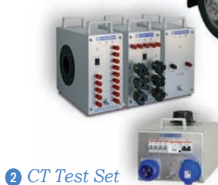
2 CT Test Set (accuracy class 0.05) for testing current transformers of accuracy classes up to 0.2S