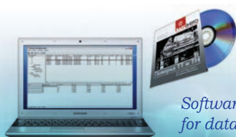
Software EmCalibrTrans for data management and generation of test reports

VCC Converter (converts Voltage/ Current curve of the CT under test) is applied for determining ratio and angle errors of instrument current transformers (complete with Delta-T software) by the indirect method