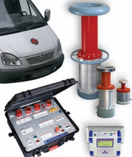
3 VT Test Set (accuracy class 0.05) for testing voltage transformers of accuracy classes up to 0.2