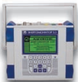
Energomonitor 3.3T1-C-TP complete with CTCS 1 A or 5 A