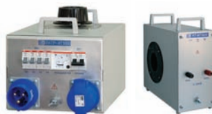
Adjustable Current Source IT5000 (up to 6000 A)